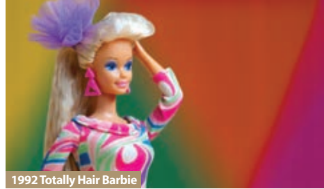
1992 Totally Hair Barbie