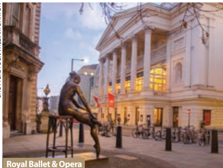
Royal Ballet & Opera