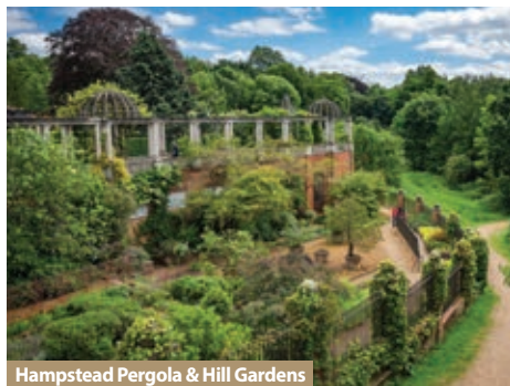
Hampstead Pergola &amp; Hill Gardens

Hampstead Pergola was built in 1904 as a place for Lord Leverhulme to enjoy the far-reaching views of his estate and to host extravagant garden parties. Over time, he bought more and more land to extend the landscaped gardens.