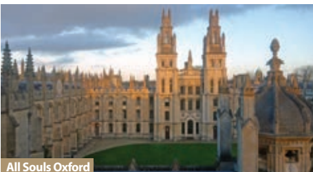
All Souls Oxford