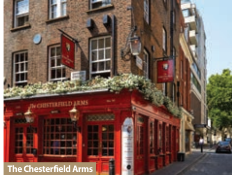
The Chesterfield Arms