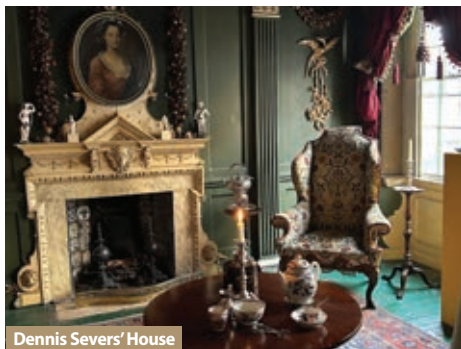
Dennis Severs' House