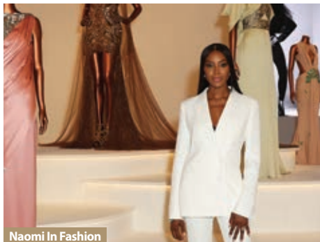
Naomi In Fashion