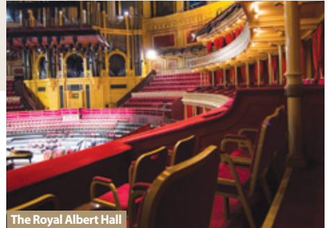
The Royal Albert Hall

There are also many exhibitions to explore within the city's extensive range of museums. A stone's throw away from Shakespeare's Globe is the Tate Modern , where between 5th October and 12th March an exhibition devoted to Cezanne can be visited, which shall include many pieces displayed in the UK for the first time. Over in South