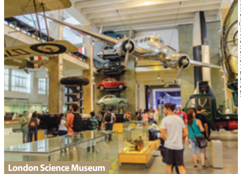
London Science Museum