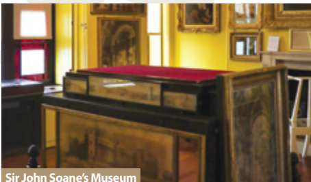
Sir John Soane's Museum