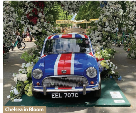
Chelsea in Bloom