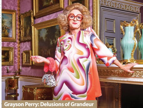
Grayson Perry: Delusions of Grandeur