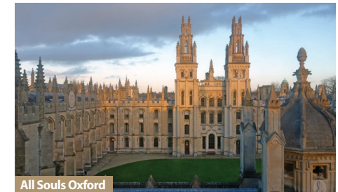
All Souls Oxford