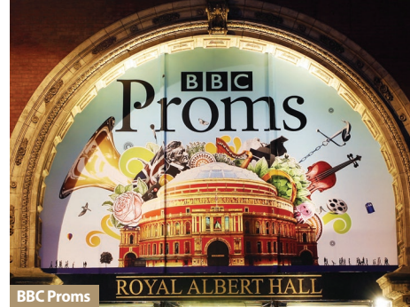
BBC Proms ROYAL ALBERT HALL