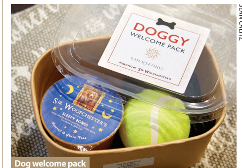
Dog welcome pack