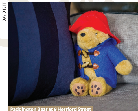
Paddington Bear at 9 Hertford Street

Andrew Lloyd Webber and Richard Stilgoe's award-winning musical follows the story of young steam engine Rusty as he races against diesel and electric locomotives, inspired by the legend of the Starlight Express train.