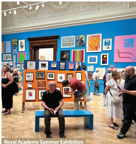
Royal Academy Summer Exhibition